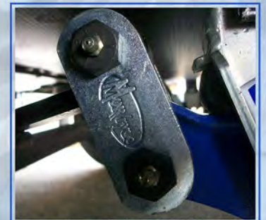
MorRyde HD Shackle Kit Greaseable Fittings, Bronze Bushings