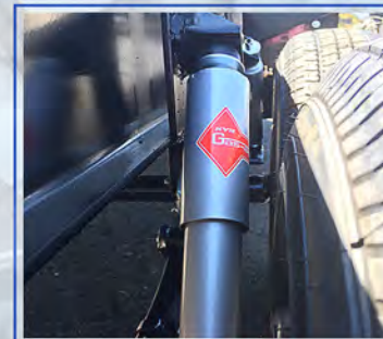
KYB World Class Shocks & Struts