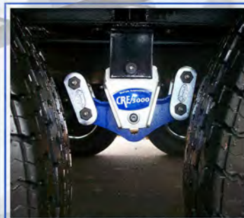
Off Road Suspension Add 3" Vertical Travel