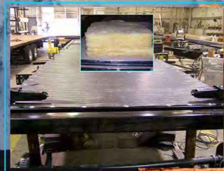
Fully Enclosed Front to Back Heated & Insulated Underbelly / Mountain Floor Insulation