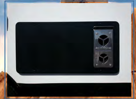
15% Larger XL Furnace (Extreme Camping Heat System)