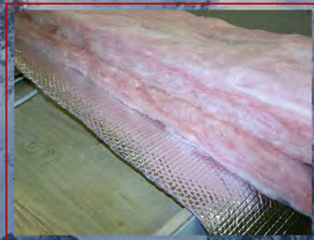
Triple Layered Four Seasons Roof Insulation