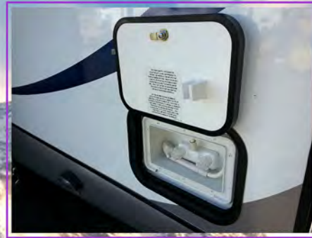
Exterior Shower Insulated by 1" Thick Thermal Insulated Luggage Door