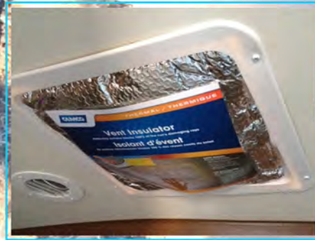
Thermal Insulated Bedroom Ceiling Vent