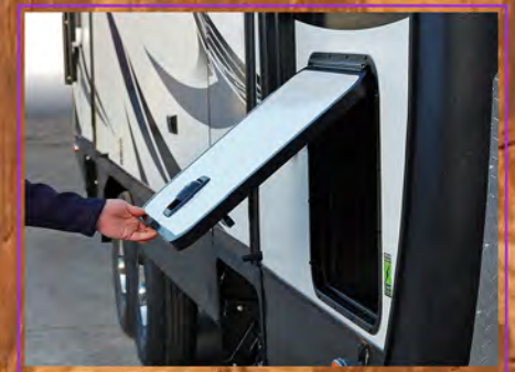
1" Thick Thermal Insulated Luggage Door Compartments