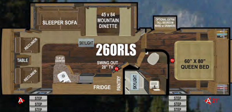
Dry Weight: 7395 ~ Floor Length: 27'