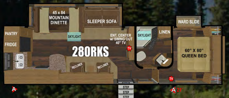
Dry Weight: 8050 ~ Floor Length: 29'