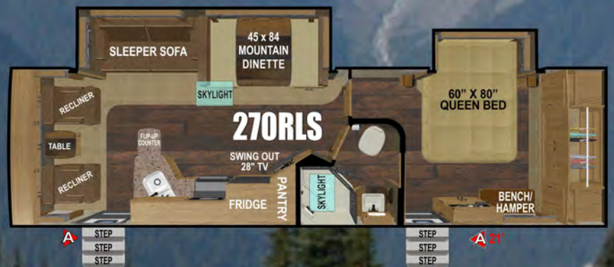
Dry Weight: 8295 ~ Floor Length: 30'