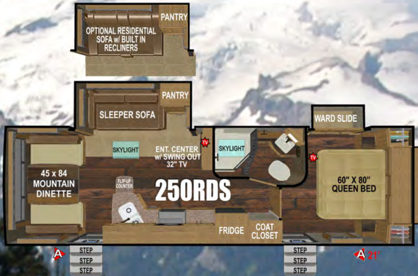
Dry Weight: 7295 ~ Floor Length: 27'

Designed with Rugged 8" Chassis, 5200lb Axles, XL Ground Clearance, Fiberglass Front Cap