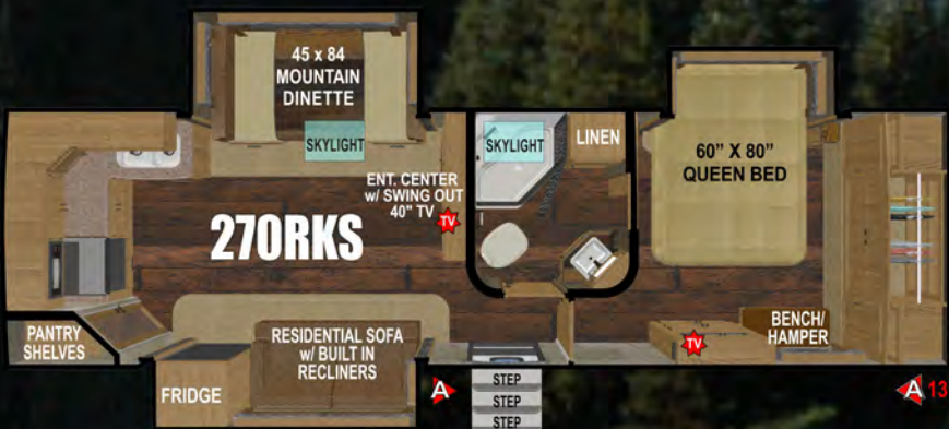
Dry Weight: 8100 ~ Floor Length: 29'