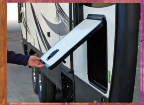
1" Thick Thermal Insulated Luggage Door Compartments