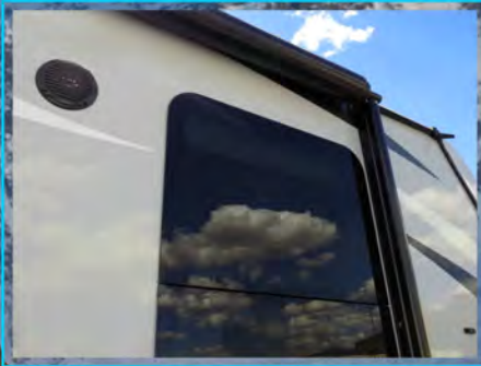
"Mountain Extreme" Thermal Pane Windows