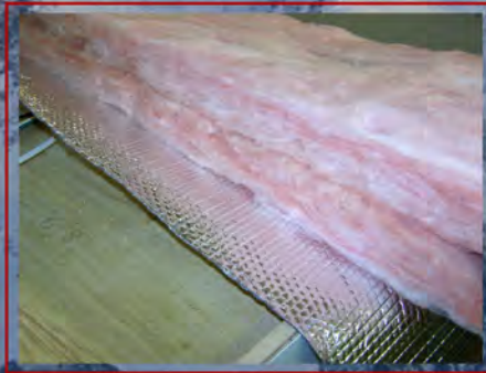
Triple Layered Four Seasons Roof Insulation