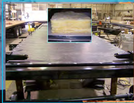
Fully Enclosed Front to Back Heated & Insulated Underbelly / Mountain Floor Insulation