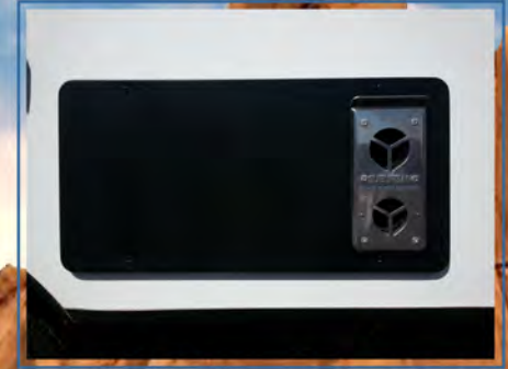
15% Larger XL Furnace (Extreme Camping Heat System)