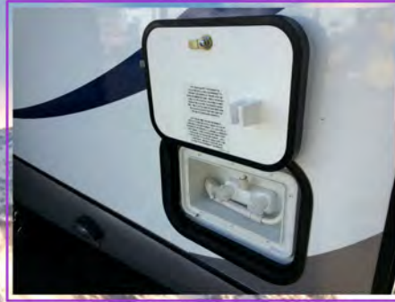
Exterior Shower Insulated by 1" Thick Thermal Insulated Luggage Door