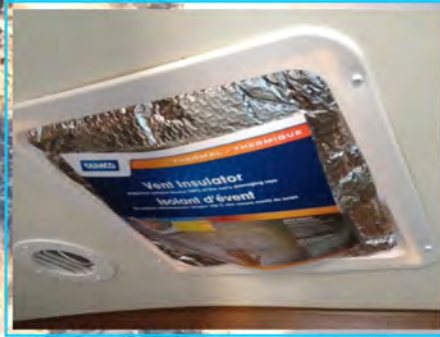
Thermal Insulated Bedroom Ceiling Vent