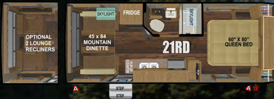
Dry Weight: TBD ~ Floor Length: 21'