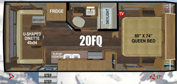
Dry Weight: 4700 ~ Floor Length: 20'