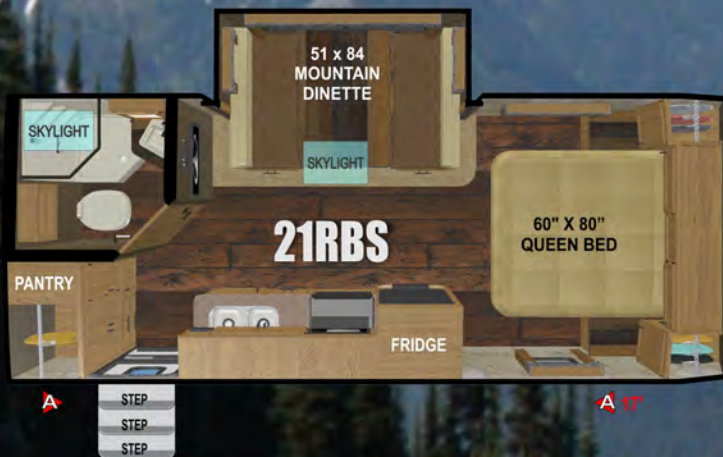
Dry Weight: TBD ~ Floor Length: 20'