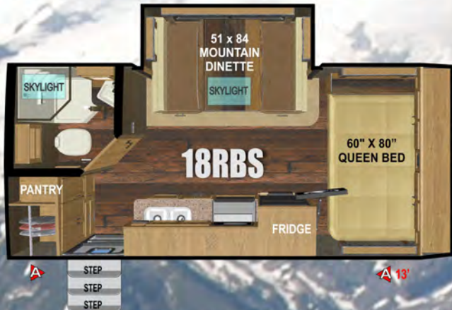
Dry Weight: TBD ~ Floor Length: 18'

COMPACT DESIGN FOR LIGHT DUTY TOW VEHICLES AND SMALLER CAMPSITES