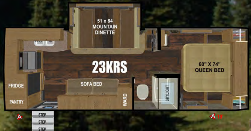
Dry Weight: TBD ~ Floor Length: 23'

TV Indicates locations for living room 12v TV's and bedroom TV prep