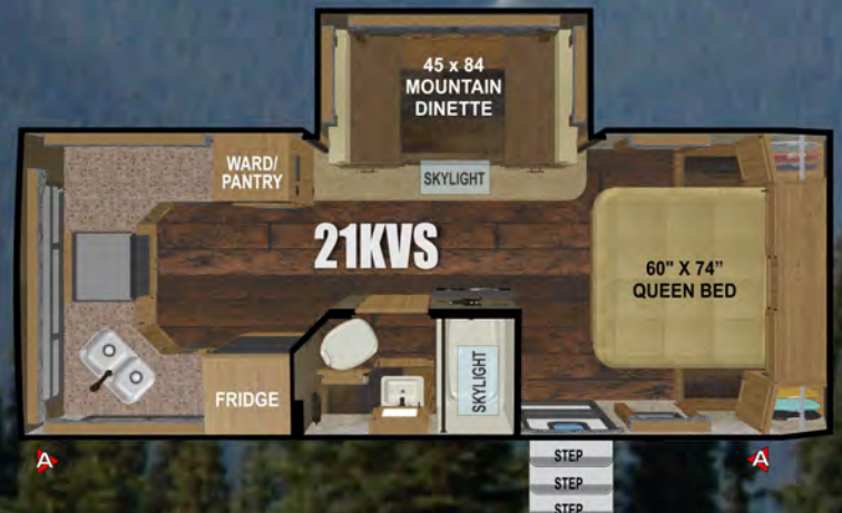
Dry Weight: TBD ~ Floor Length: 21'