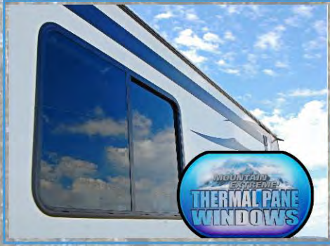
'Mountain Extreme' Thermal Pane Windows