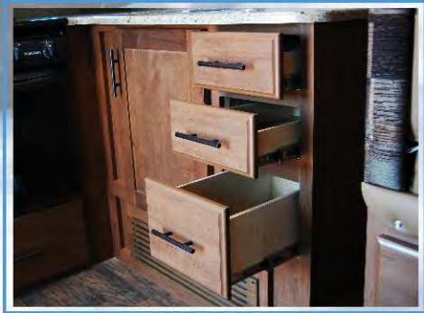
Full Extension 100lb Drawer Glides