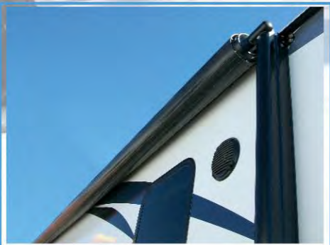
XL Adjustable Electric Awning w/ Rain Dump Arm