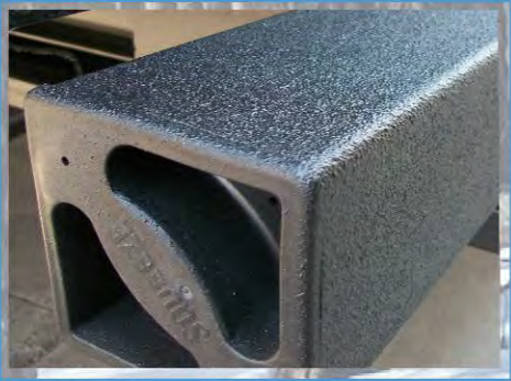
Rugged Armor Guard Protected Rear Bumper