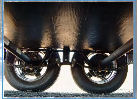
Heavy Duty Axles With Off-Road Brake System & 15" Mud Flaps