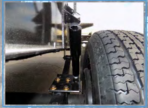
HD Shock Absorbers With XL Shock Plate