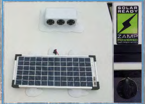
'No Boundaries' Off Grid Solar Ready - Includes Door Side Portable Solar Port