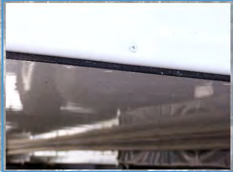
Laminated Fiberglass Slide-Out Floor