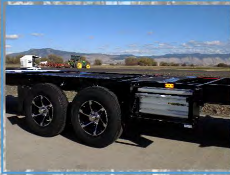
Custom Built Cambered Off-Road Chassis