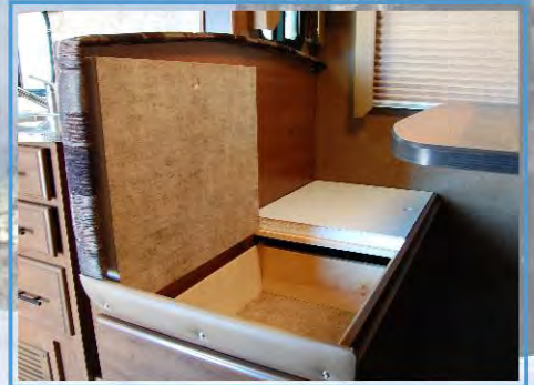
HD Dinette Construction