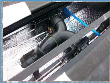
Heated Holding Tanks With Protected Valve System