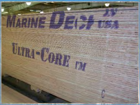
Plywood Roof & Floor Decking