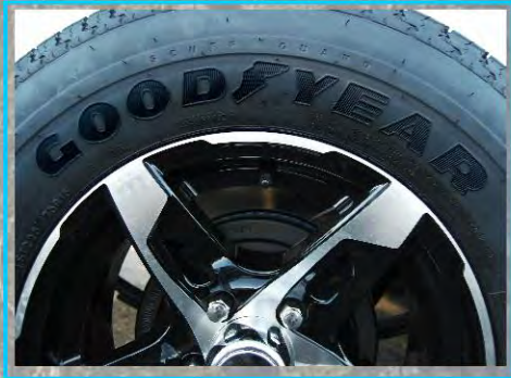
Goodyear Radial Trailer Approved Tires & Aluminum Wheels Spare Tire