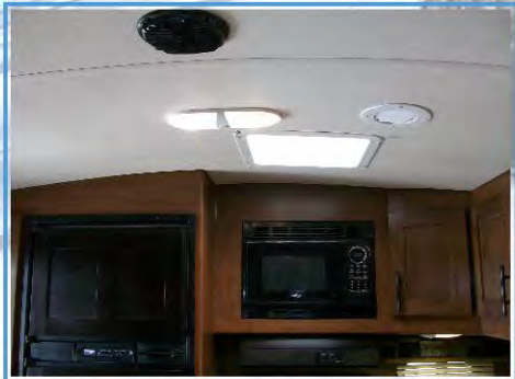
Vaulted Radius Ceiling Providing Approx 5" Addl Headroom