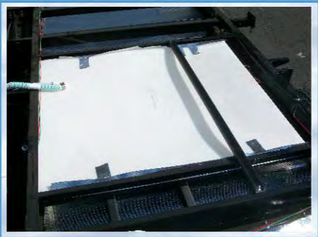
XL Fresh Water Capacity 66-82 Gallons