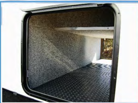
Ozite Lined Rubber Diamond Plate Luggage Compartments