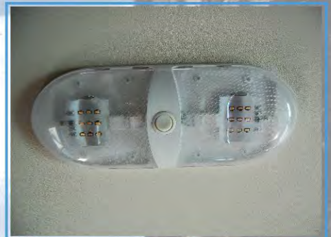
LED Interior Lighting