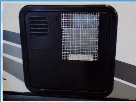
10 Gallon Water Heater (Most Models)