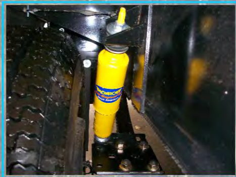
HD Monroe Gas Shocks