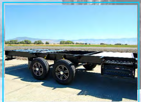
Custom Built Cambered Off-Road Chassis