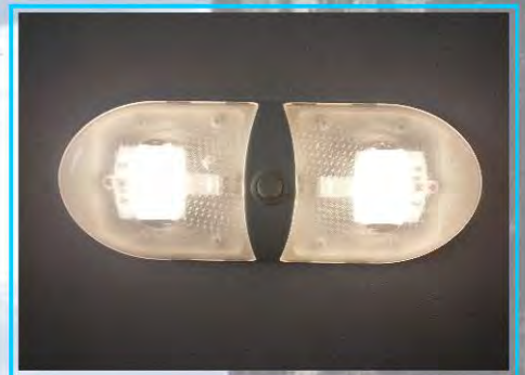
LED Interior Lighting