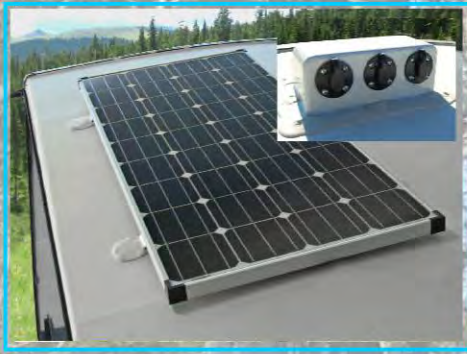
Off Grid Solar Ready - Up To 500 Watts - Includes Door Side Portable Solar Port