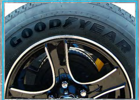
Goodyear Radial Trailer Approved Tires & Aluminum Wheels, Spare Tire