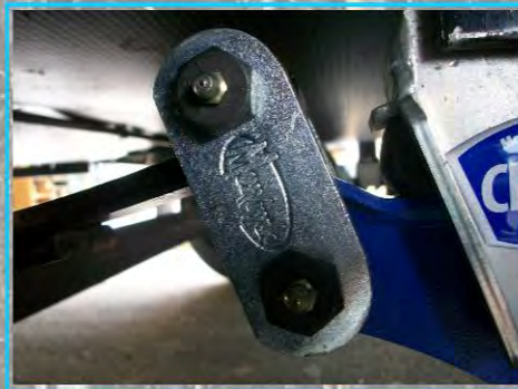
MorRyde HD Shackle Kit 3000 lb Suspension