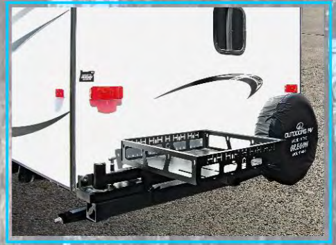
Optional Off Grid Generator Ready Bracket