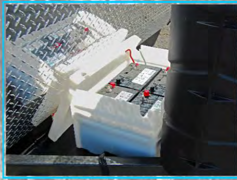
Off Grid Battery Rack (Up to 4 Batteries & Box Not Included)