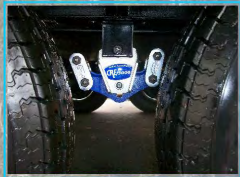
Off Road Suspension