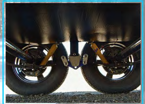
Heavy Duty Axles with Off-Road Brake System & 15" Mud Flaps