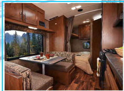
Vaulted Radius Ceiling Providing Approx 5" Addl Headroom