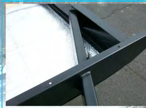
Rugged Integrated A-Frame Chassis Construction & Protected Junction Box Wiring