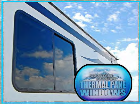
'Mountain Extreme' Thermal Pane Windows