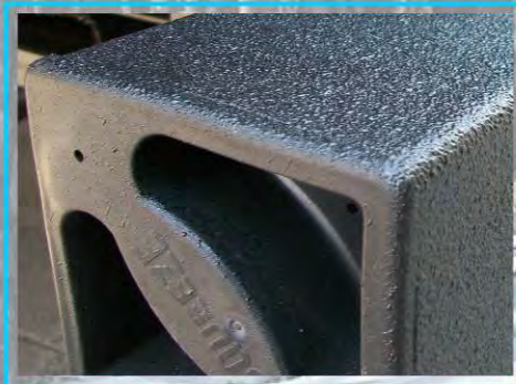
Rugged Armor Guard Protected Rear Bumper