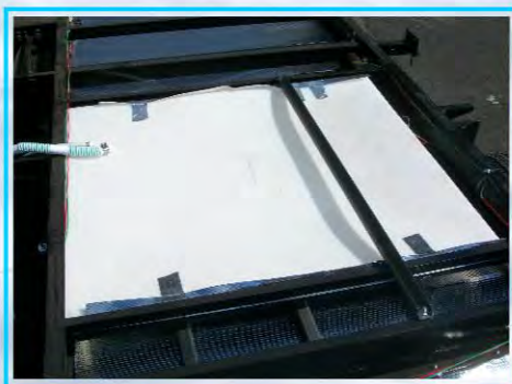
XL Fresh Water Capacity 66-80 Gallons