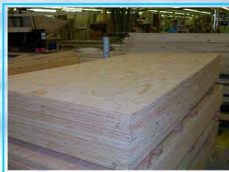
Plywood Roof & Floor Decking