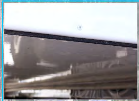
Laminated Fiberglass Slide-Out Floor